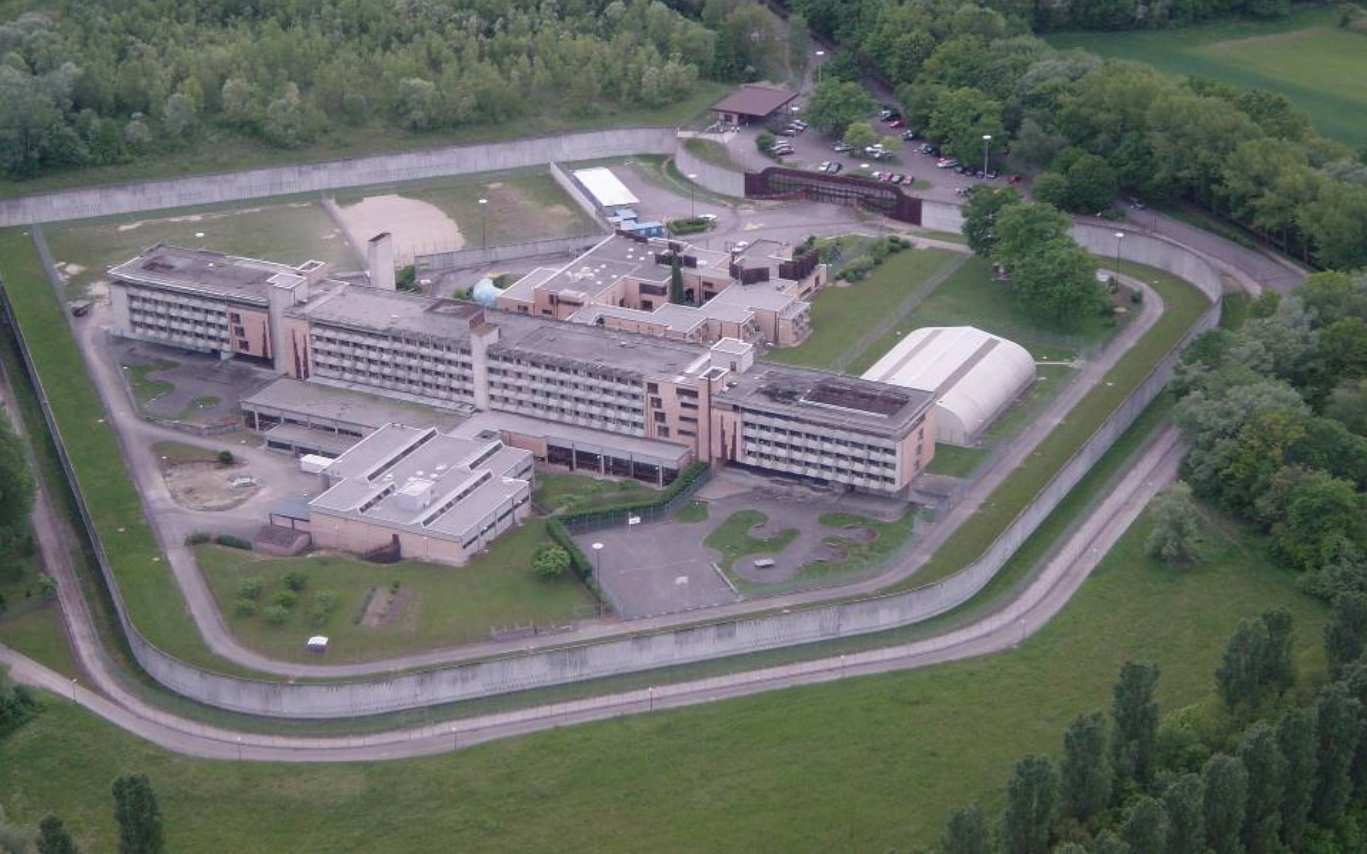
Prison Champ-Dollon, Geneva, Switzerland